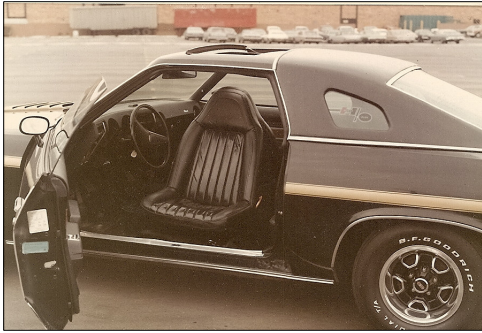
Black on black 73 H/O with swivel buckets

interior and the same for the white car.