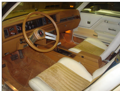
1979 H/O Oyster white interior

1979 Hurst/Olds settled back down as far as the interior color choice was concerned. The cars were either black or white and the interiors only had 4 options. You could select Dark Camel Tan velour (code 62E), Dark Camel Tan vinyl (code 62W) or Black Vinyl (code 19W) in a black Hurst/Olds. The white Hurst/Olds buyers were offered Dark Camel Tan velour (code 62E), Dark Camel Tan vinyl (code 62W) or the more rare Oyster White vinyl (code 12W) interior in a white H/O.