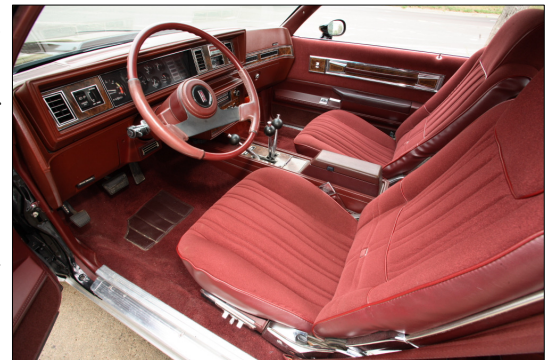
1983 & 1984 H/O Dark Maple Cloth interior

The 1983 H/O only came in 1 exterior color. All were black with silver lower edge and red stripes. There was a limited choice of interior options, 3 to be exact. This time they offered Dark Maple (burgundy) Velour (Code 77C), Dark Maple vinyl (Code 77V), and Light Sand Gray Velour (Code 60C).